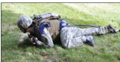
Soldier crawling wearing vest, body armour and blue sensor pads

When a soldier complains that they feel pressure in a certain area, the pressure