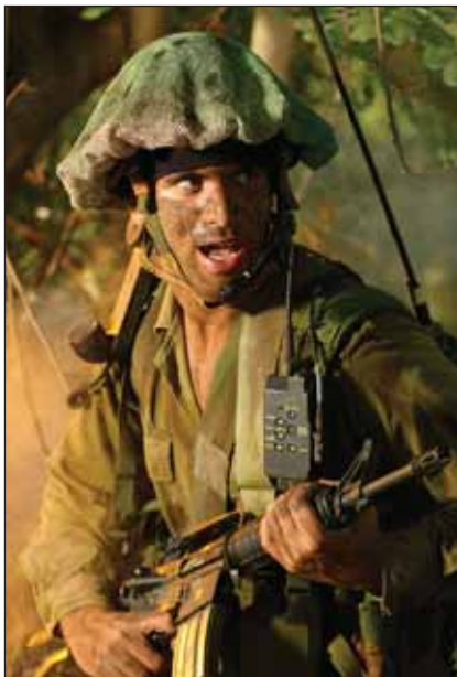
Soldier with PNR-500 and CNR-9000

PDU – Personal Digital Unit – A ruggedised, tactical powerful computer especially designed for the individual infantry warrior. The compact, energy-efficient, computer empowers the soldier with data processing and storage capabilities, includes an integrated GPS that locates the soldier, and the Integrated Infantry Combat System C2 application, and TIGER® – (Tactical Intranet Geographic Dissemination in Real time) system. The PDU interfaces with all the peripheral elements and as an option a PCMCIA Advanced Tactical Modem can be attached to the PDU to enhance existing radio's performance. TIGER® enhances real time decision making at all force levels by unifying all channels, integrating them into one dynamic tactical intranet, and creating interest-based, geographic data dissemination. TIGER® provides the relevant information at the right time and provides optimum message transfer, flow and continuous