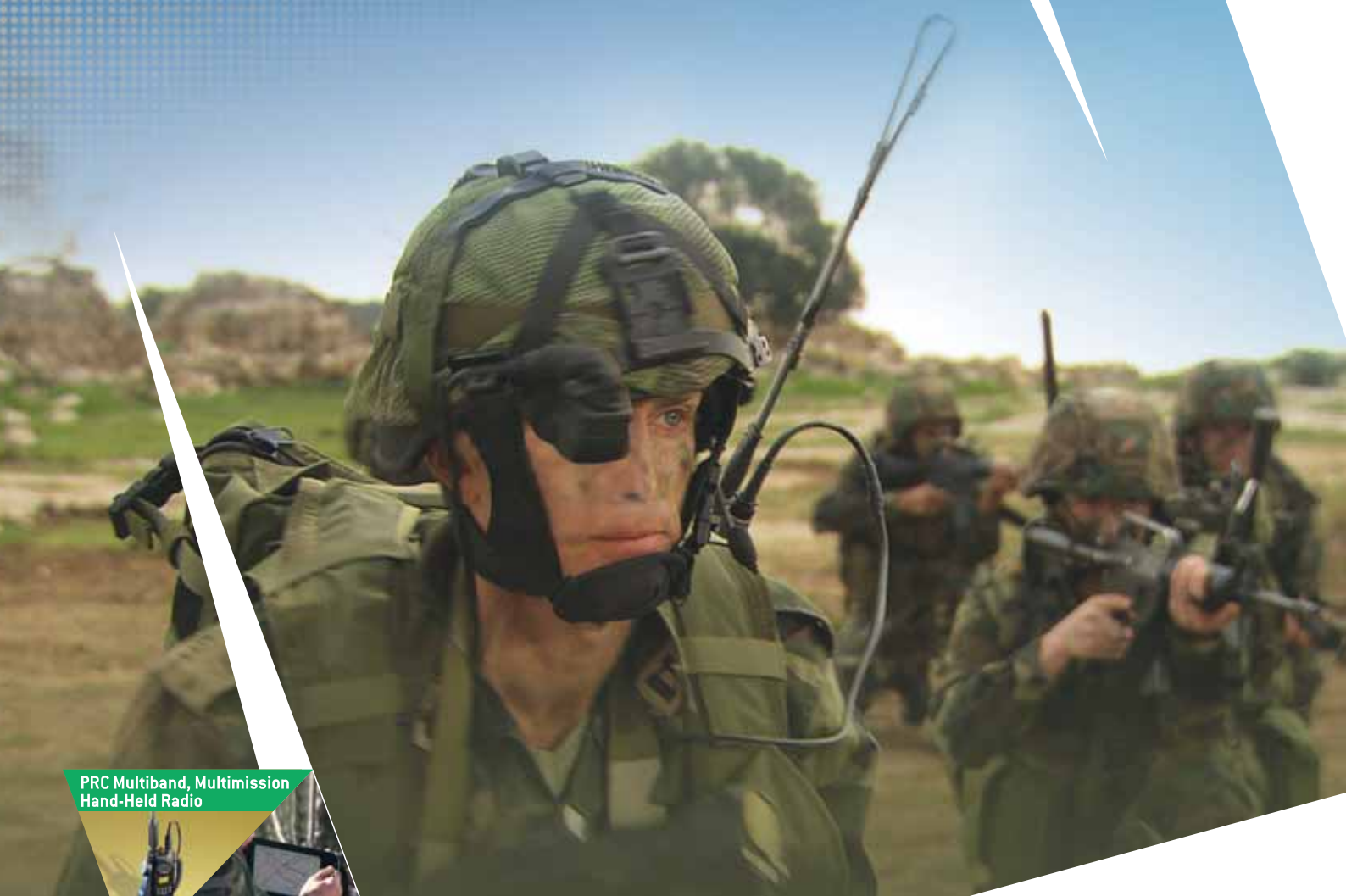
PRC Multiband, Multimission Hand-Held Radio