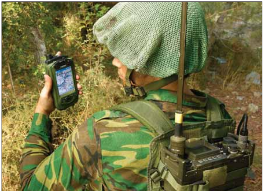
Soldier with RPDA and CNR-9000HDR

The Dominator® incorporates Elbit Systems' C4I software solutions for the infantry user (C4I SW), based